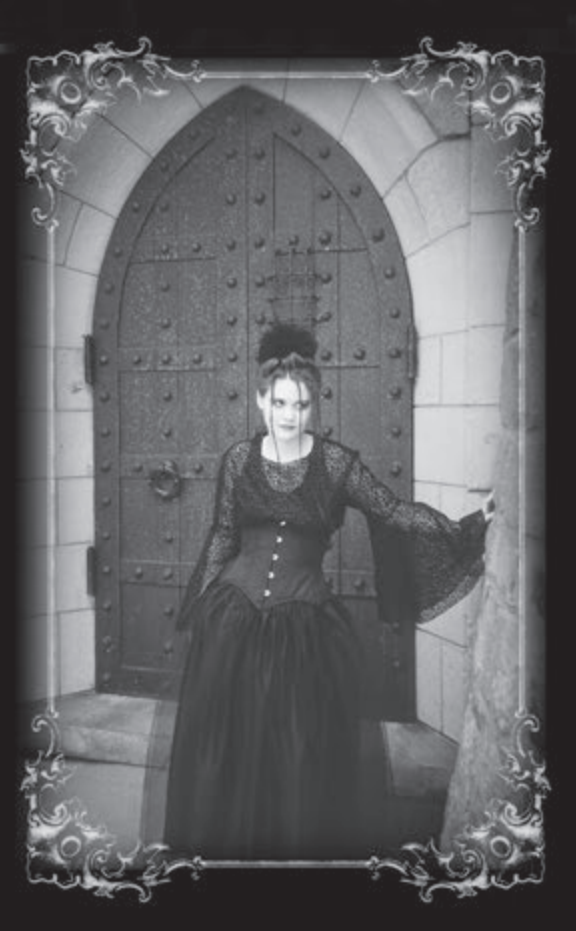
The complete on-line Atrocities catalogue can be viewed at: www.atrocities.com Atrocities ~ PO Box 162 ~ Salem, MA 01970