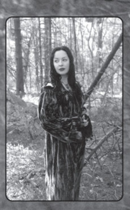
The romantic Gothic Nightdress is inspired by the aesthetics of the pre-Raphaelite movement, made from lush crushed velvet with gathered, gently flared sleeves trimmed in bridal lace, a softly ruffled neckline and empire waist.

The Arachne Shroud, a bewitching cape made from a double-layer of glistening black spiderweb lace with matching full hood and floating hemline. Worn with the Venetian Slipdress.