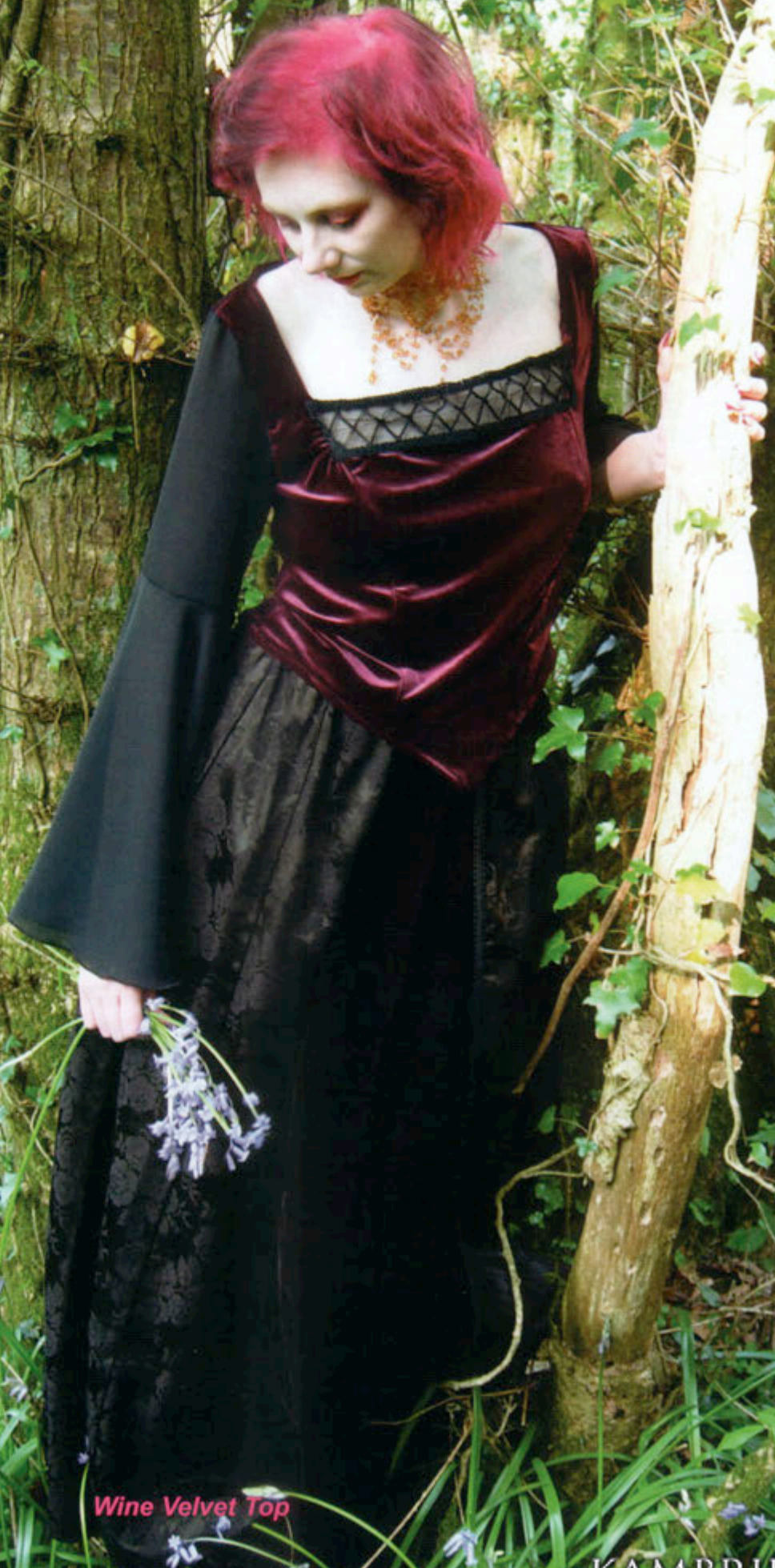
Wine Velvet Top