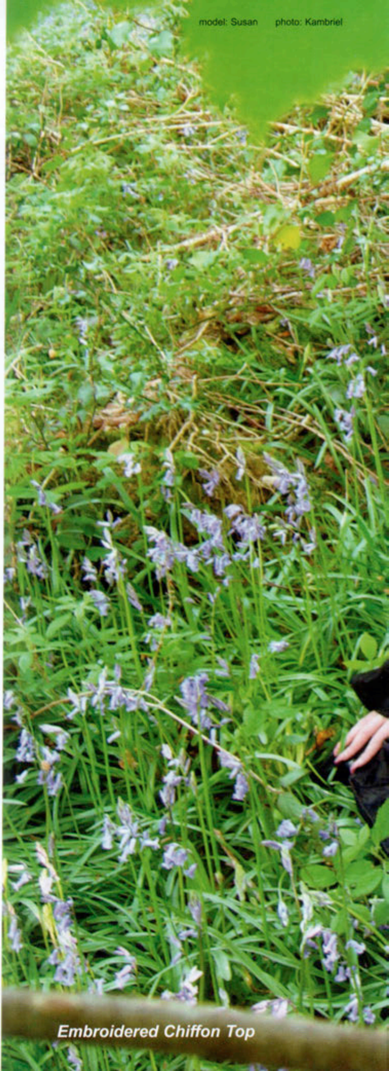
Embroidered Chiffon Top