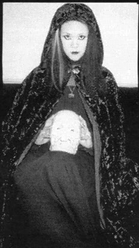
The editor shrouded and hooded