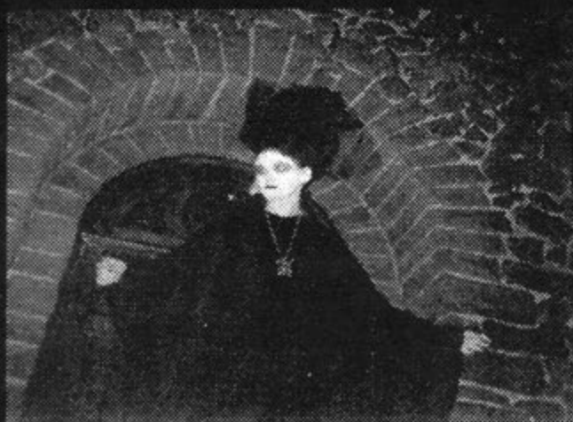
" as night unfolds her wings..."