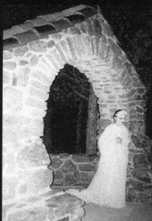
"...The Draulean Bride..."